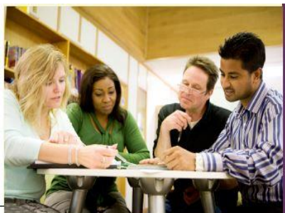
Left: Some graduate students currently enrolled in the college.

Career Opportunities. Graduates of the program may continue with doctoral studies, pursue teaching careers in post-secondary education, or work in leadership and managerial roles in the hospitality and tourism industry.