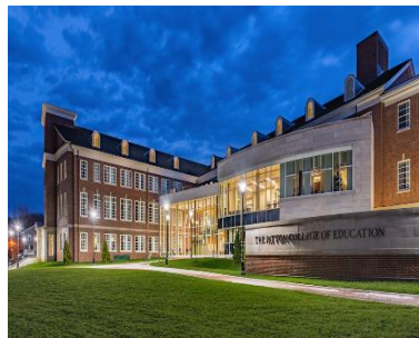
Right: McCracken Hall, where the program is housed.